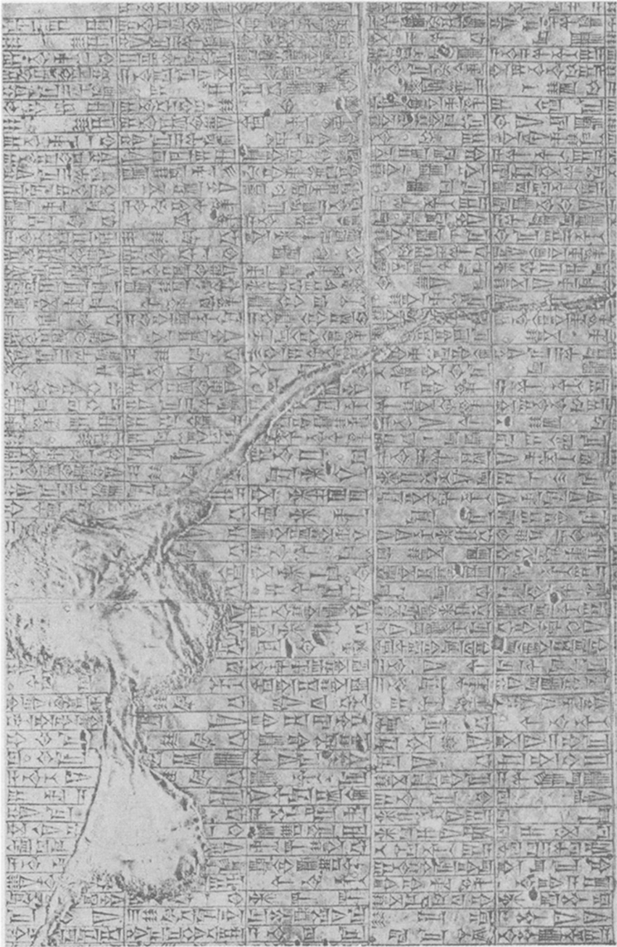
PHOTOGRAPH OF TEXT.