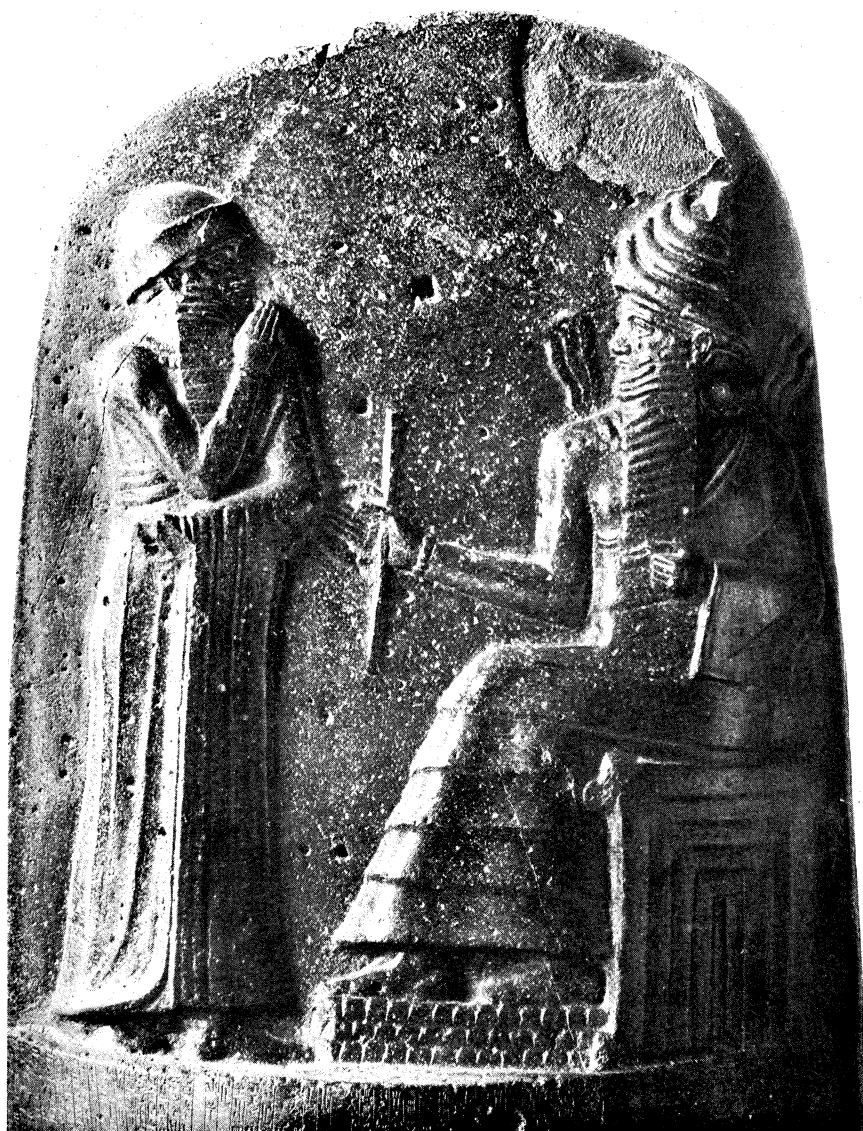
HAMMURABI RECEIVING THE CODE FROM THE SUN GOD.